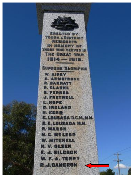
Toora War Memorial